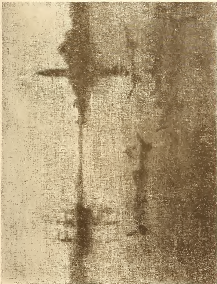
Nocturne in Blue and Silver. "THE LAGOON"—VENICE.